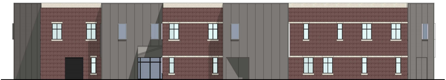
Rendering of Renovated County Building from Hickory Lane

Additionally—and sadly—the white pine next to the 1905 Courthouse also has to be removed. The removal of the white pine is due to the damage it is doing to the Courthouse roof and gutters. Removal of the white pine is expected to take place some time in October.